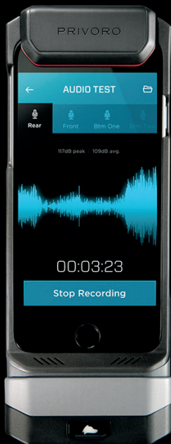
Testing Audio Protection